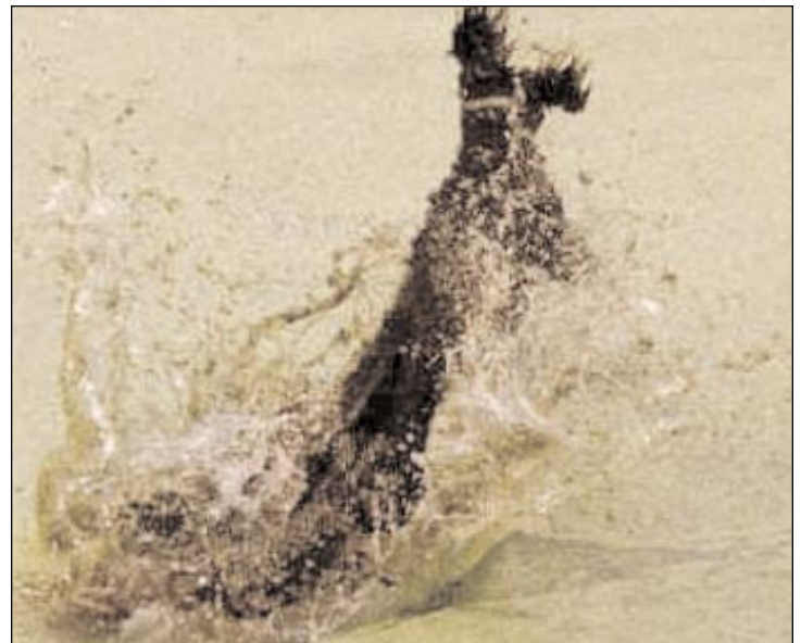
During. Voik in action at a Hunt Test.