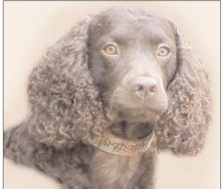
Before. SHR SR Nissop's Voi Kauhea SD WD CGC (Voik) on his way to the 2000 Nationals

The LLHRC has two of the three American Water Spaniels in the world that are confirmation champs that also hold field titles through three separate organizations (AWSC, NAHRA, HRC).