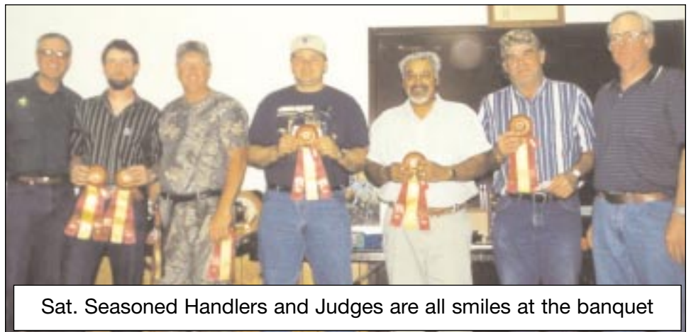
Sat. Seasoned Handlers and Judges are all smiles at the banquet