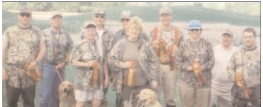
Posing is just part of the fun for handlers collecting a ribbon for Sunday Started.