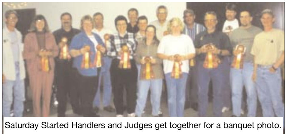
Saturday Started Handlers and Judges get together for a banquet photo.