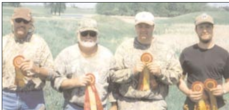
Sunday Seasoned Handlers show off the ribbons well earned.