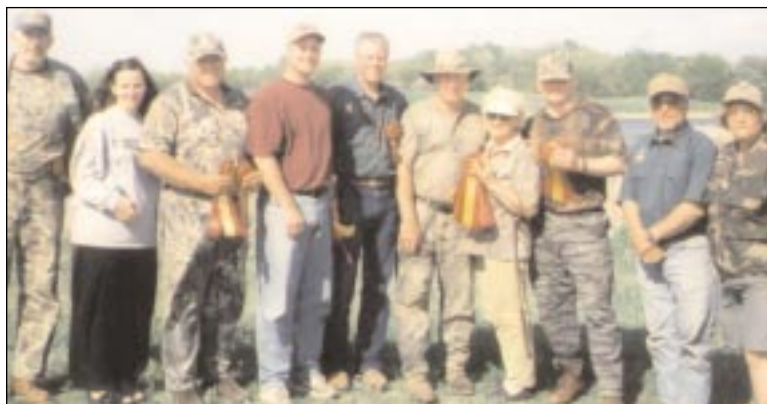
Sunday Finished Handlers and Judges pause after a good day.