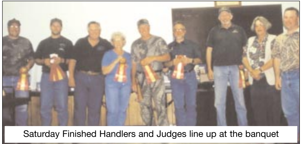
Saturday Finished Handlers and Judges line up at the banquet